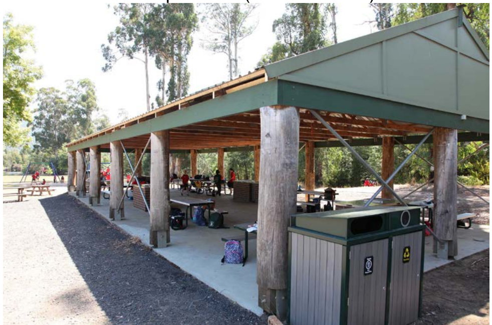
1215 Lunch at Gallipoli Park (2 minute walk)

1240 Depart to Steavenson Falls (10 minute bus trip)