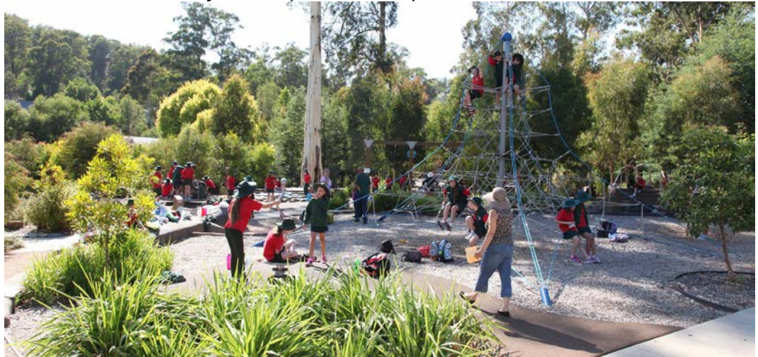
Restrooms are located at the playground

1050 Talk and walk Marysville main street